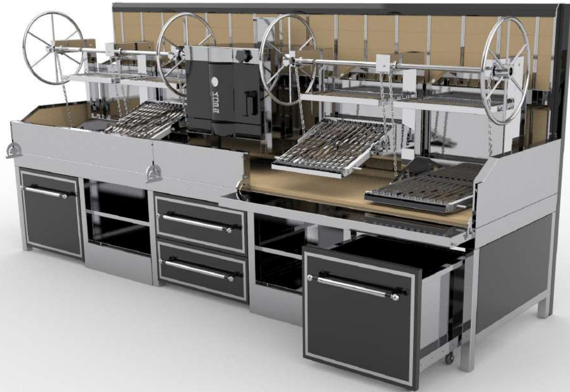
Openfire wood burning grill