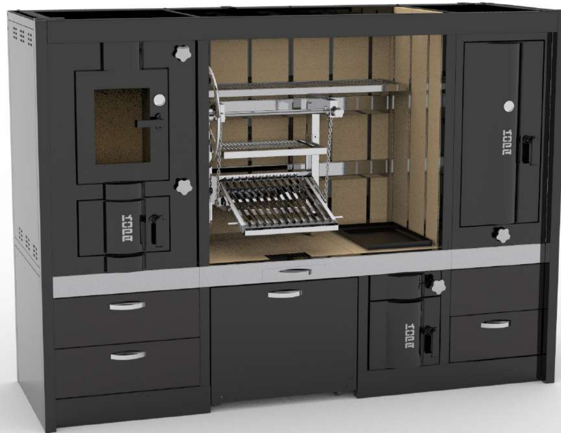
Kopa FirePlace with Indirect oven, Smoker, Parilla and Plancha