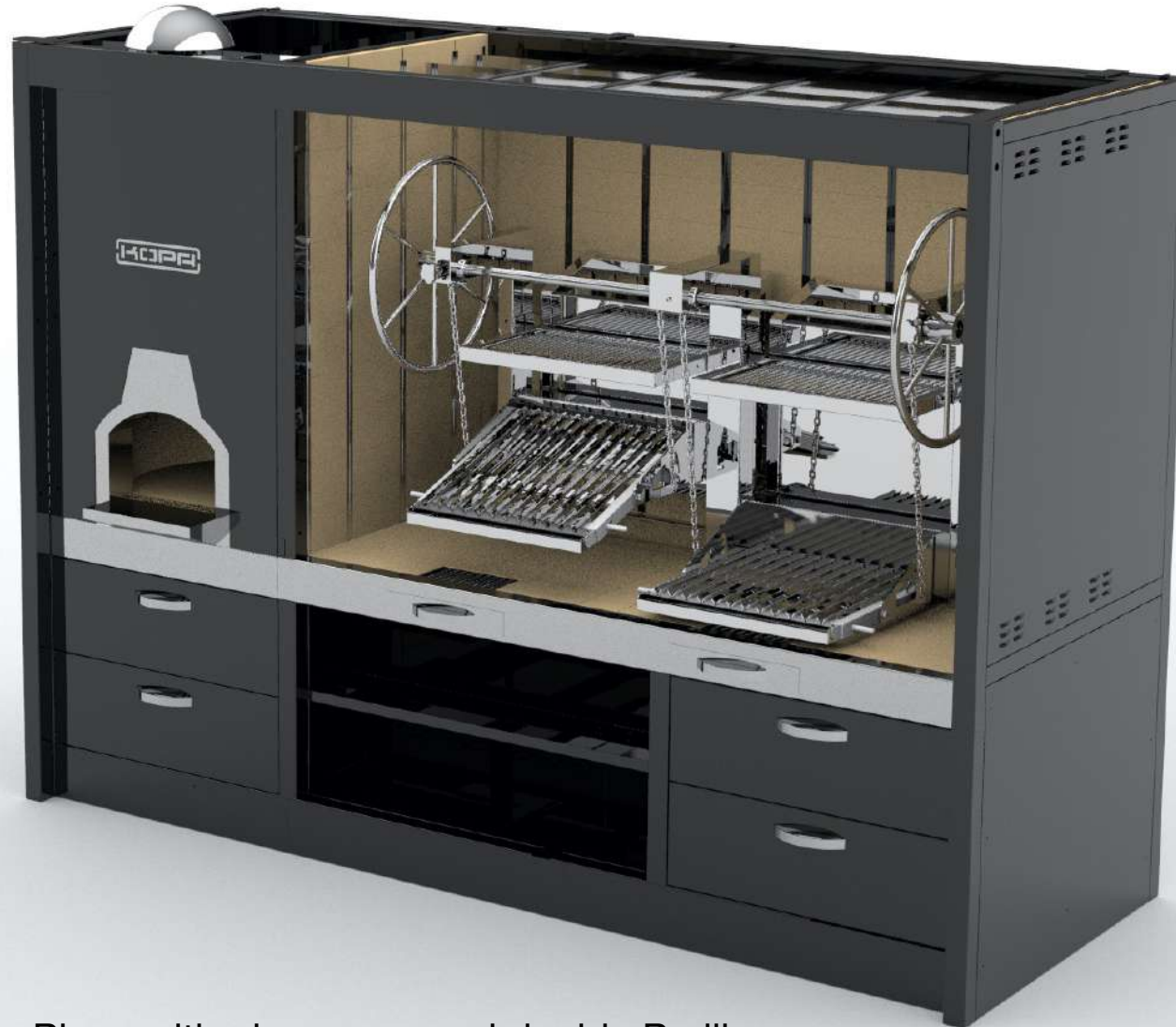
Kopa FirePlace with pizza oven and double Parilla