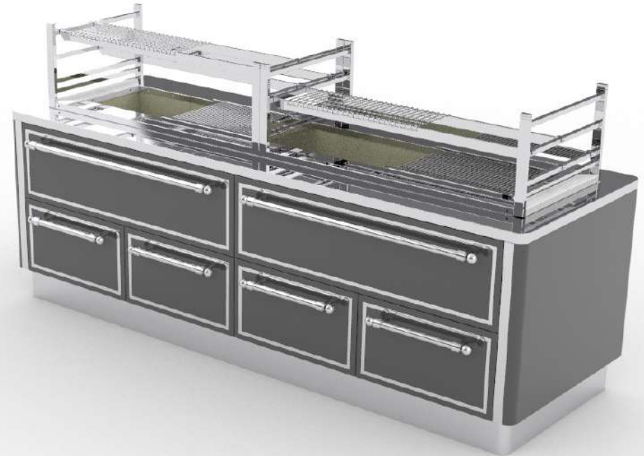
Double robata with refrigerated drawers