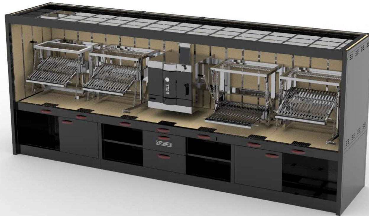
Kopa FirePlace with four parillas and indirect oven