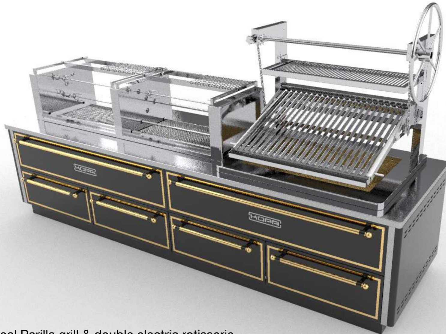
Charcoal Parilla grill & double electric rotisserie