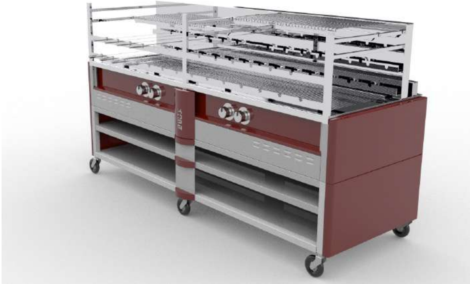
Rotisserie grill / gas-lavastone operated with 36 electrical turning point for skewers