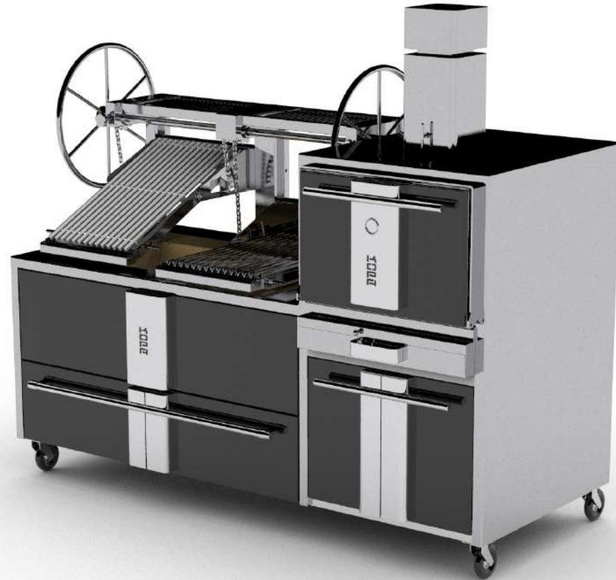
Kopa Grilling Combo with Double Parilla and Charcoal Oven