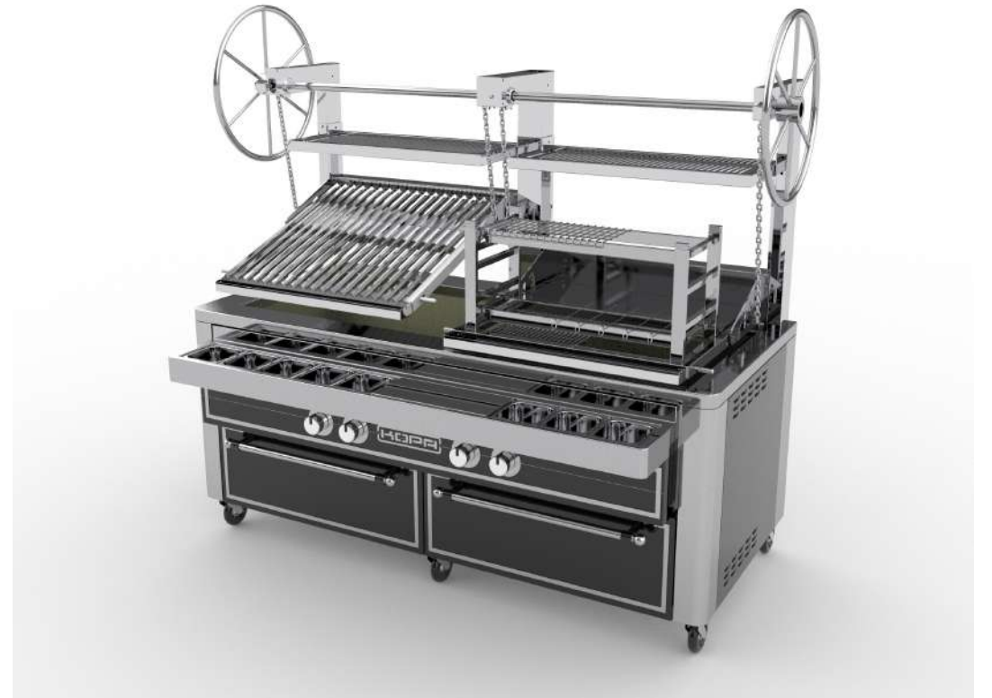
Custom Charcoal Parilla Grill with electric ignition and diverse grilling inserts