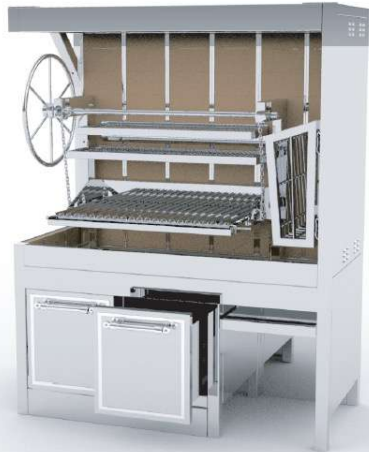
Openfire grill with Parilla section and storage