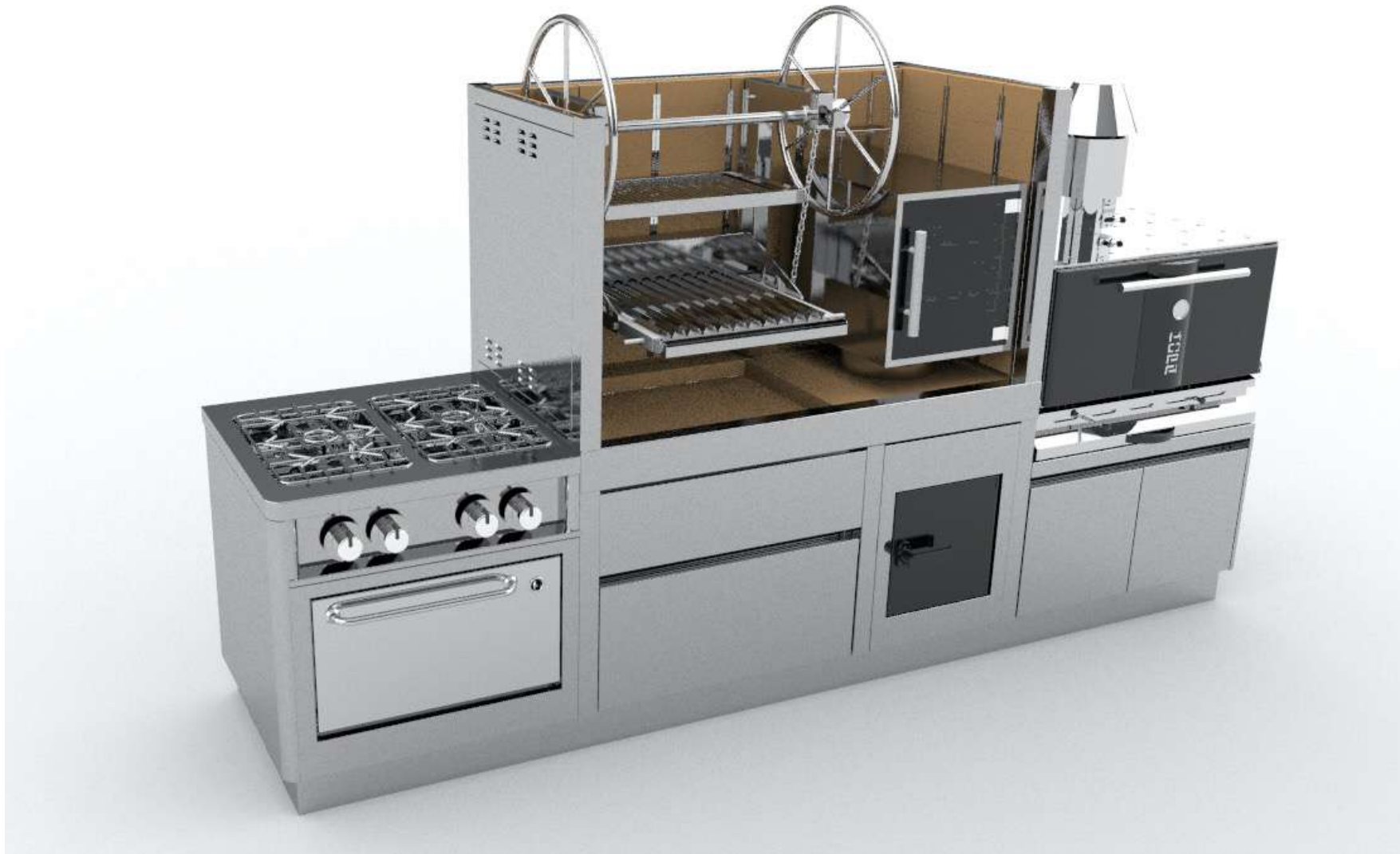
Kopa Grilling / Cooking Suite with gas range, Parilla, Smoker and Charcoal Oven