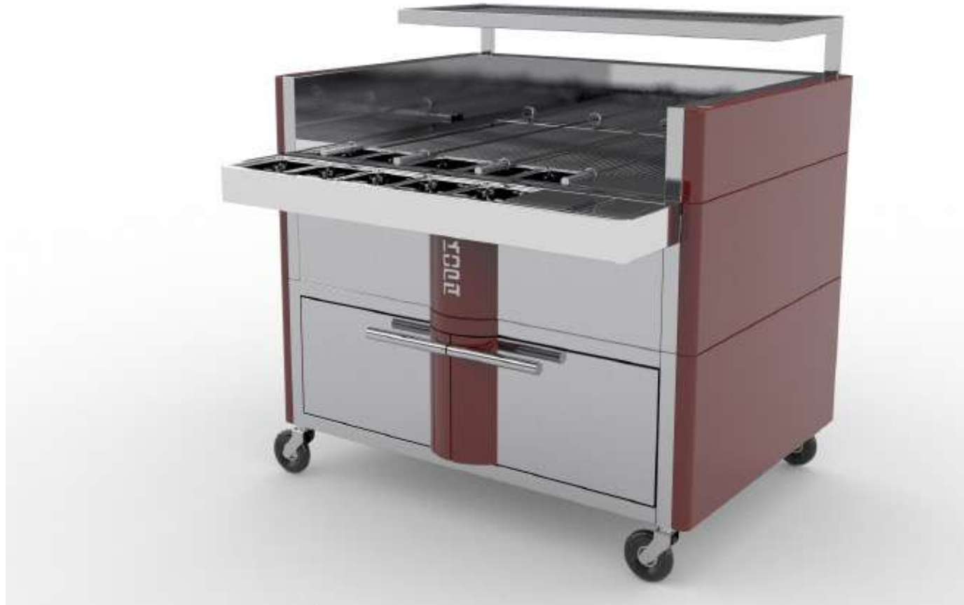
Charcoal grill “Portugese” style with electric turning skewers (Option: Gas / lavastone)