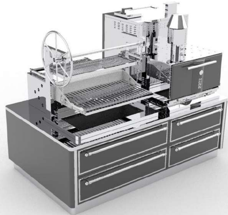
Grilling suite: Kopaoven, Robata, Parilla and smoking oven. All charcoal