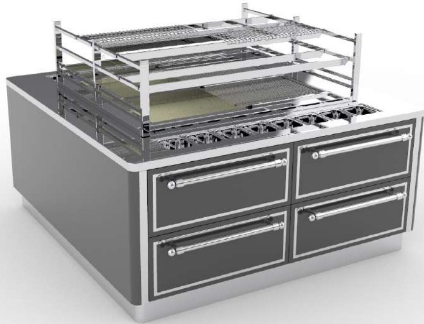
Mangal island with storage