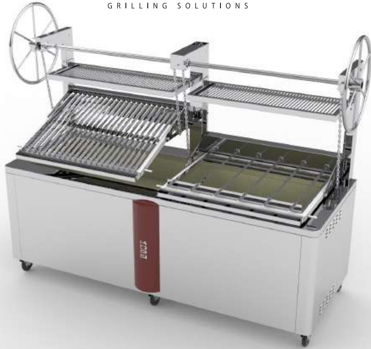
Charcoal double Parilla grill & one sided electrical turning skewers section