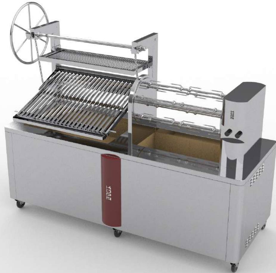
Charcoal Parilla with planetary rotisserie